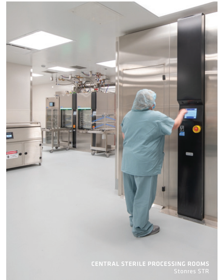
CENTRAL STERILE PROCESSING ROOMS Stonres STR

Chemical-resistant flooring is designed to stand up to a wide range of harsh chemicals over long periods of time. This type of flooring is one whose functional and aesthetic performance won't degrade with repeated chemical spills or the use of industrial-grade cleaning agents. This allows you to keep important areas 100% sanitary at all times without having to worry about the longevity of your surfaces. They are specifically designed for chemically-intensive healthcare environments.