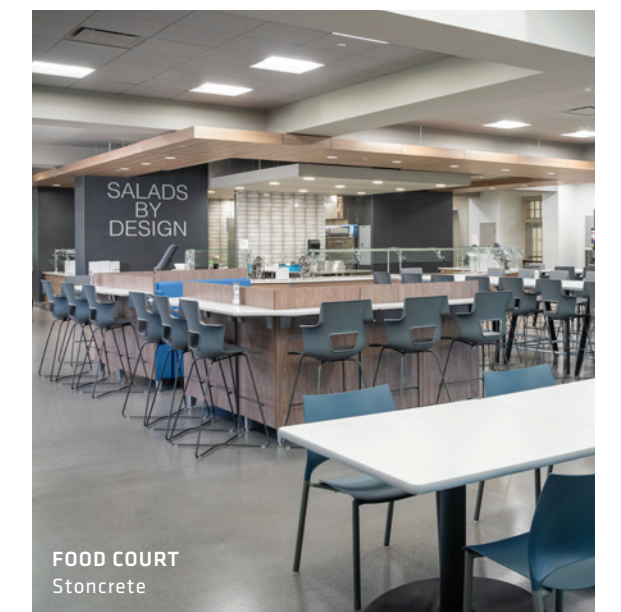
FOOD COURT Stoncrete

We take responsibility for products and workmanship, bringing you a highly personalized approach to products and services. Our sales experts work with you directly and bring the additional resources of Stonhard's construction management team, installation crews, and architectural, design and engineering group. Real-time problem solving and installation experience. There's no problem we can't solve.