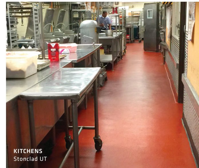
KITCHENS Stonclad UT