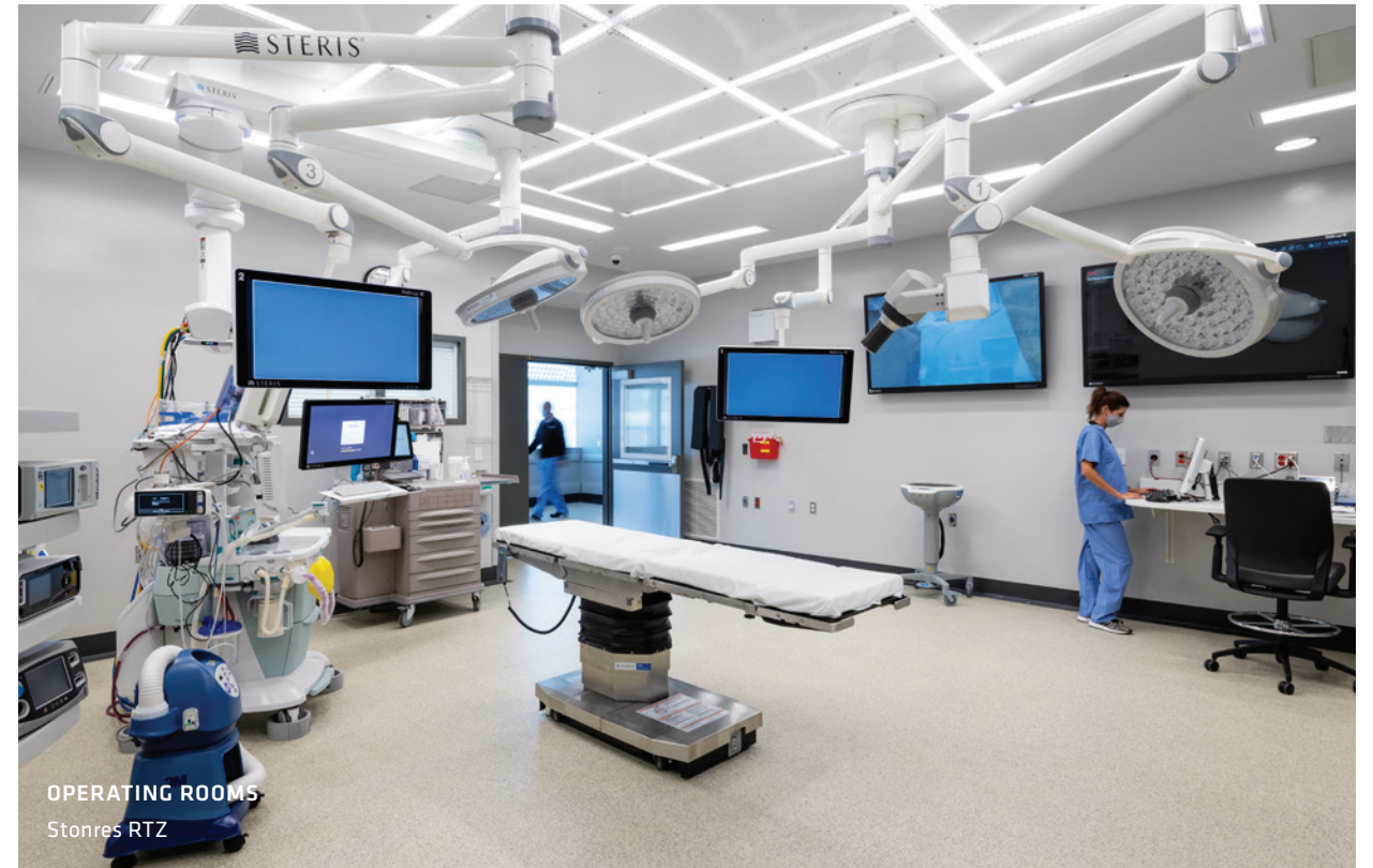
OPERATING ROOMS Stonres RTZ