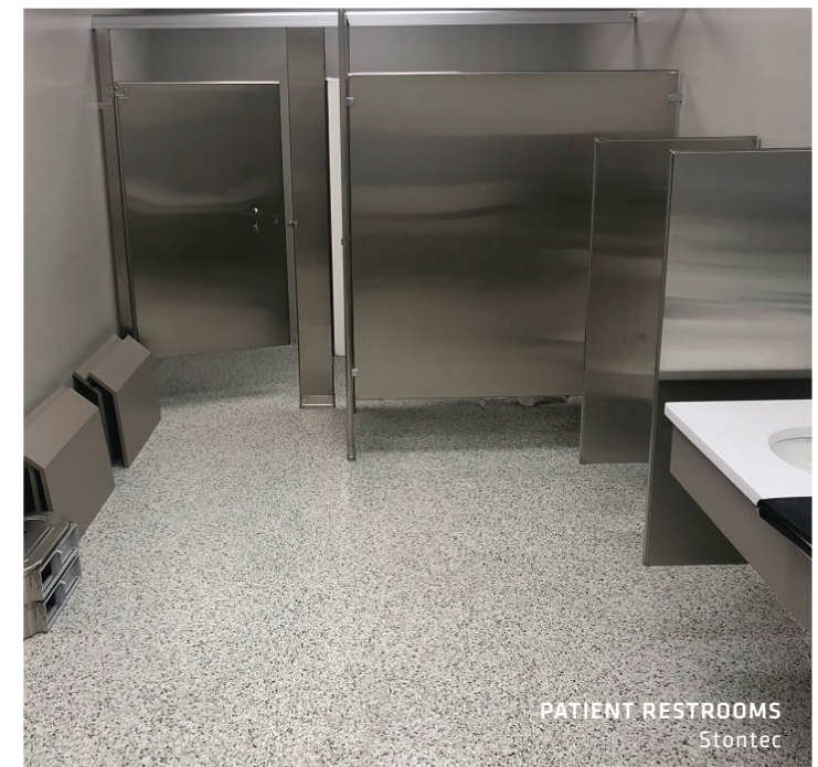
PATIENT RESTROOMS Stontec